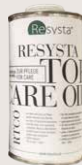
RTCO for maintenance

single work process. In the case of light fading, becoming dull or partial abrasion of the original oil film, RTCO can prevent a complete new treatment of the surface. RTCO contains refined natural oils, soybean, sunflower and rapeseed oil, isosaliphates, wax dispersions, lead-free and barium-free driers.